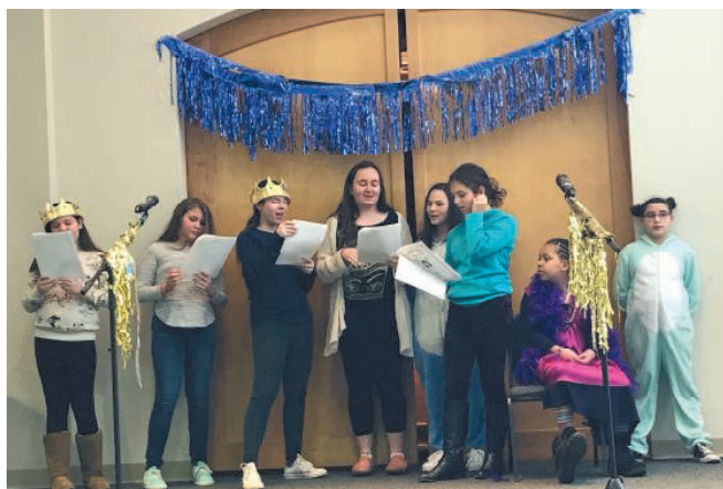
Jr Choir members present the Purim Spiel for Religious School students and teachers.

Followed by a special Oneg honoring our teachers!