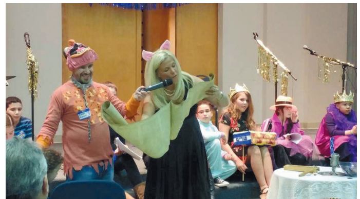
The Spiel included more costumes, the Junior Choir, megillah reading and potluck dinner.