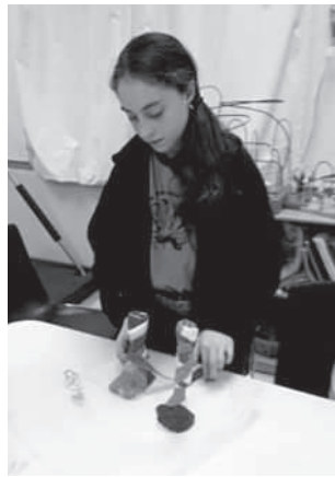
At left, students present homemade hummus and tehina they made in the CHUGGIM cooking course. On the right, Shabbat candle sticks are being made in the Ritual Art course.