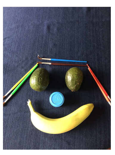
Zoe - Grade 5