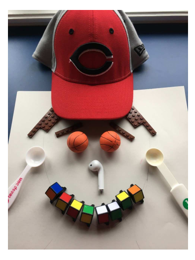
Aaron - Grade 5