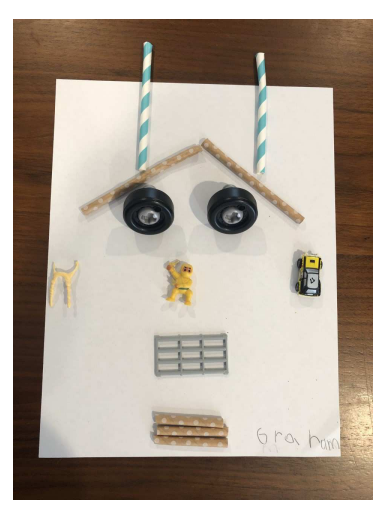
Graham - Kindergarten