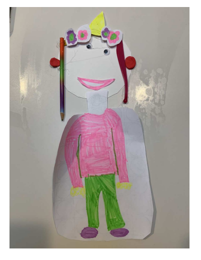
Madelyn - Grade 1