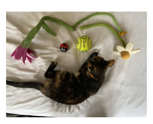
Esther - Grade 6