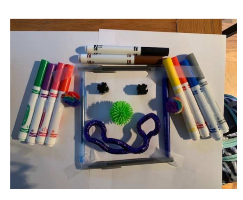
Sofia - Grade 7