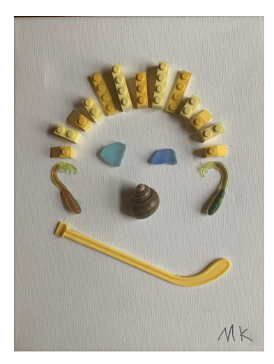
Maylon - Kindergarten