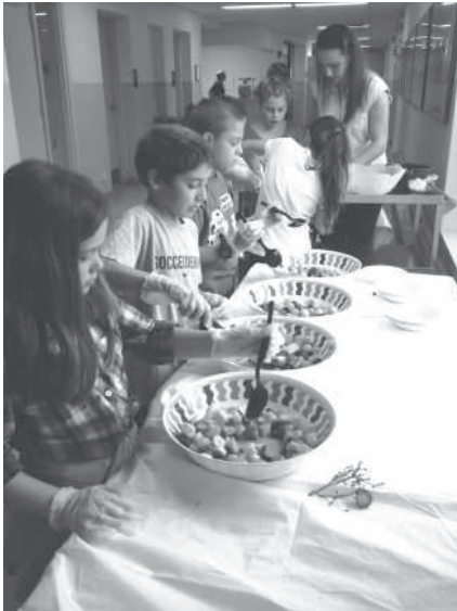
Religious School Students participate in the Bubbie's Kitchen Chug. One of the Madrichim helps them with delicious fresh fruit salad.

5 th – 7 th graders had the option of learning and playing Jewish music, creating a TBZ newspaper, talking in Hebrew, learning about new technology, learning about Jewish foods, and setting up a documentary team to interview famous women from the Torah.