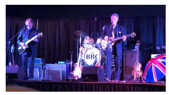
Friday, June 19, doors open at 7 p.m., music at 8 p.m. 805 Delaware Avenue

Featuring the best of the Beatles & '60s Music.