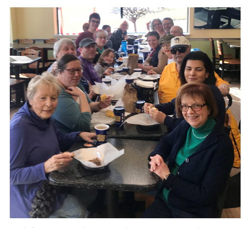
Bagel Breakfast Bunch! Bagel Jay's was the setting for this popular Engagement get-together in February.

Art Corridor, 805 Delaware Avenue Reception: Wednesday, May 13, from 5 - 7 PM